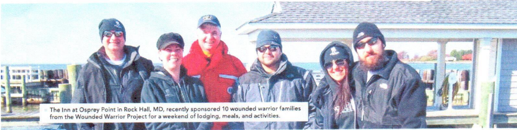
The Inn at Osprey Point in Rock Hall, MD, recently sponsored 10 wounded warrior families from the Wounded Warrior Project for a weekend of lodging, meals, and activities.